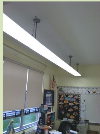
Our Lady of Hope in Blackwood – Before and After