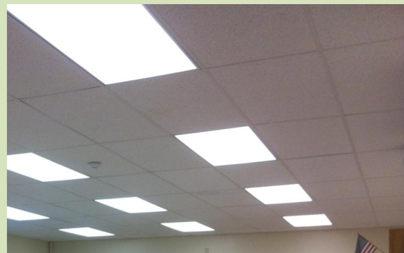
St. Catherine's - Before and After