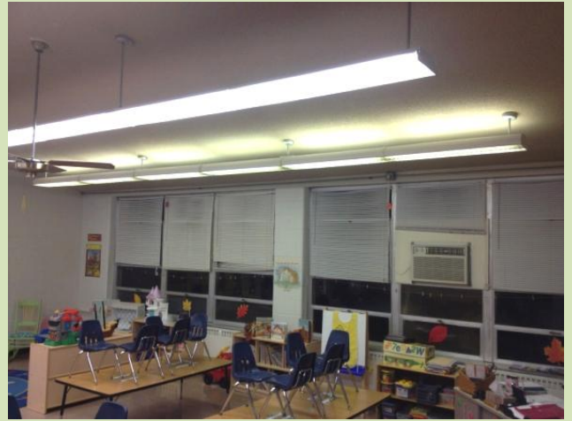
John Paul II – Before and After