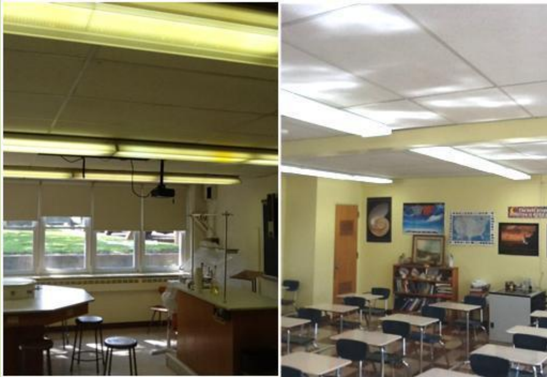
Our Lady of Mercy - Before and After